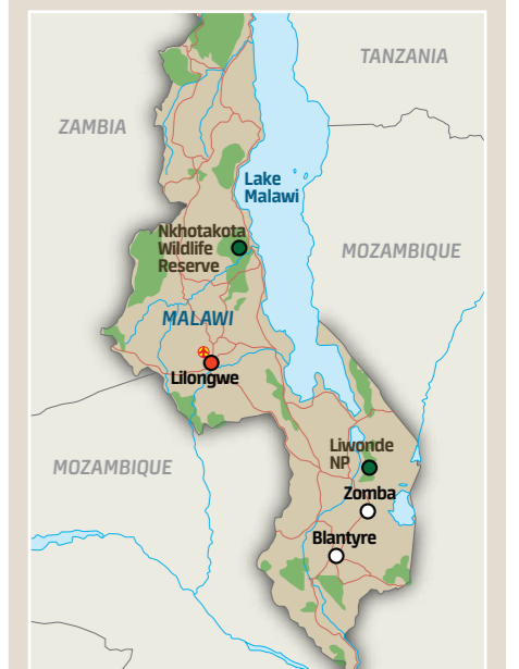
CENTRAL AFRICAN WILDERNESS SAFARIS